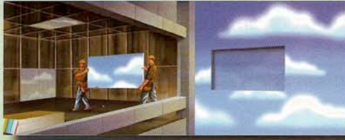
Circle #114 On Reader Service Card

For more information please visit www.certainteed.com/airrenew .